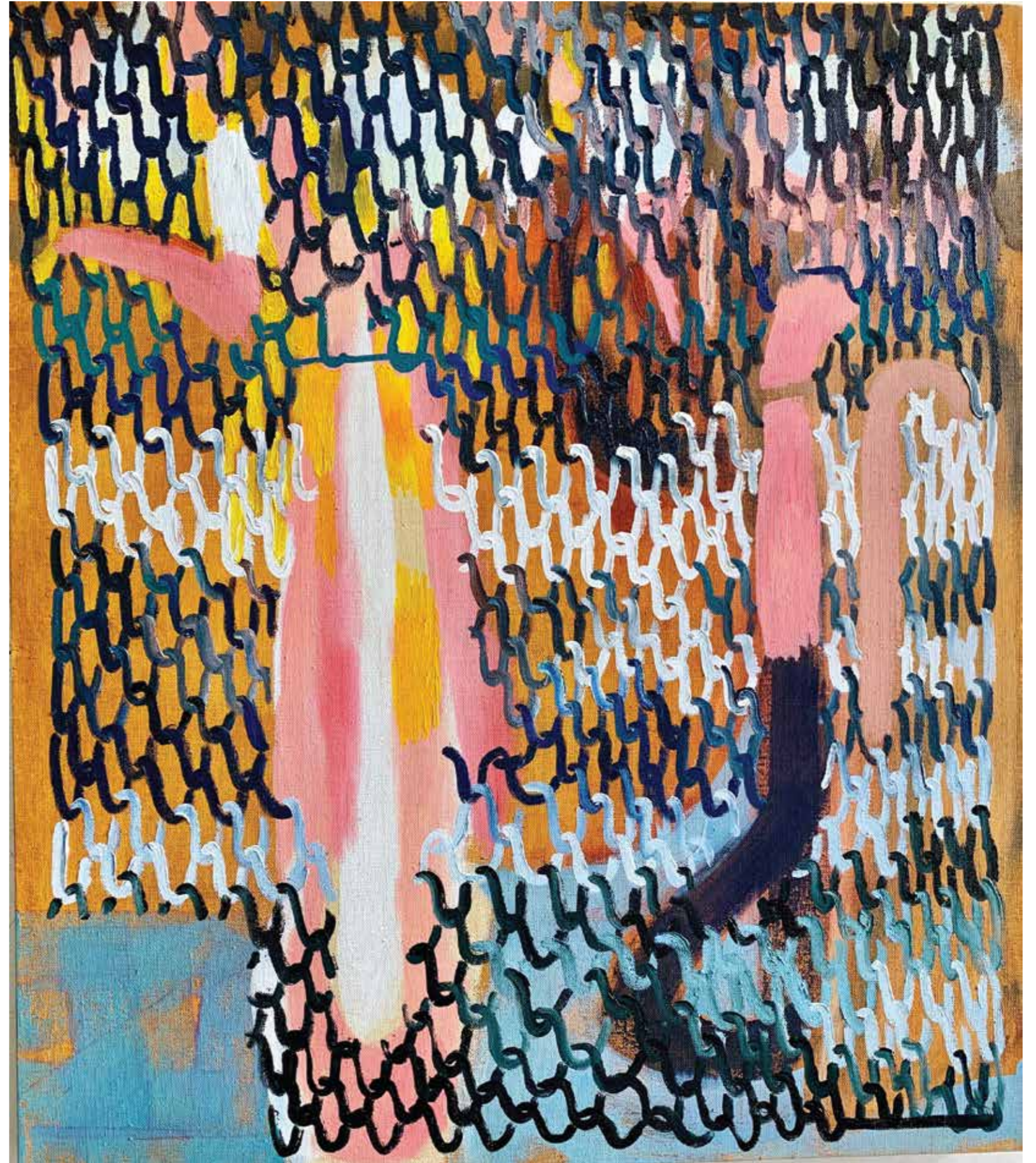
Knit 30 x 26 inches - 2019