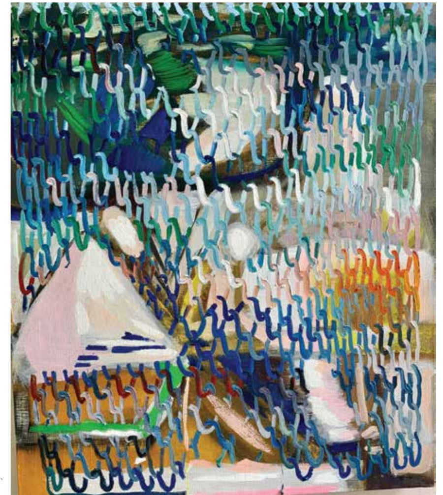
Alejandra Seeber - Knit - 30 x 26 inches - 2019