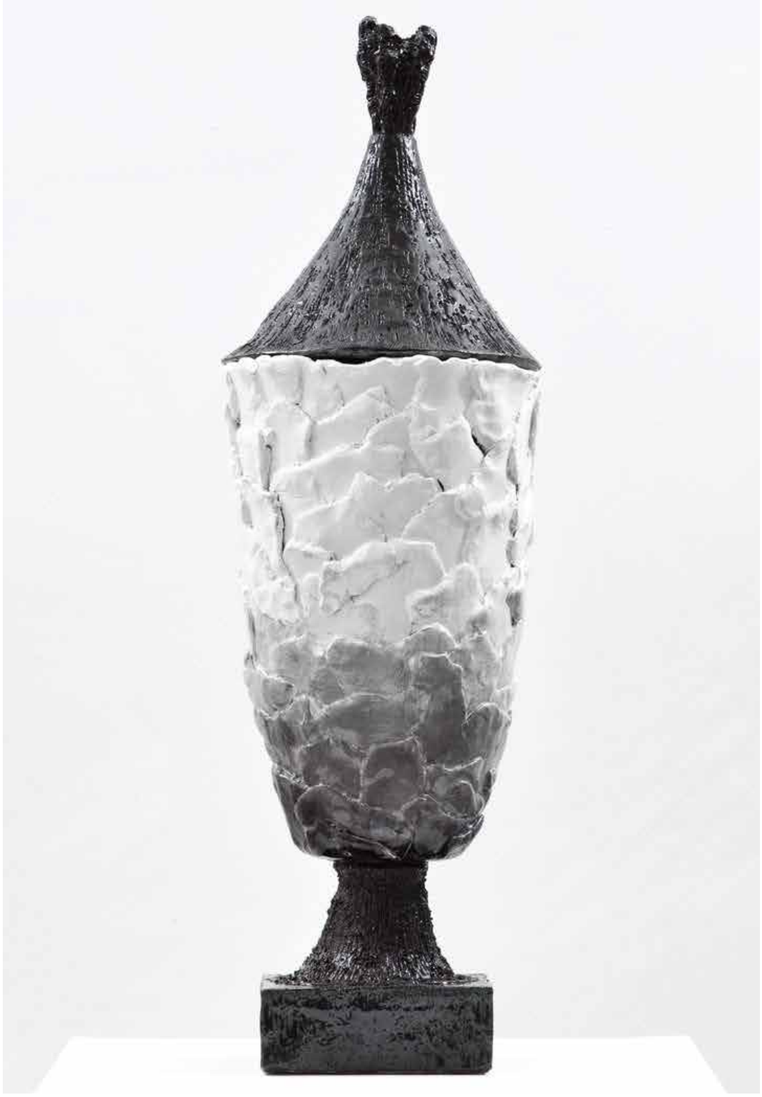
Manuel Siguënza. Untitled. Glazed Pottery. 2014. 31,4 x 9,8 ø Inches