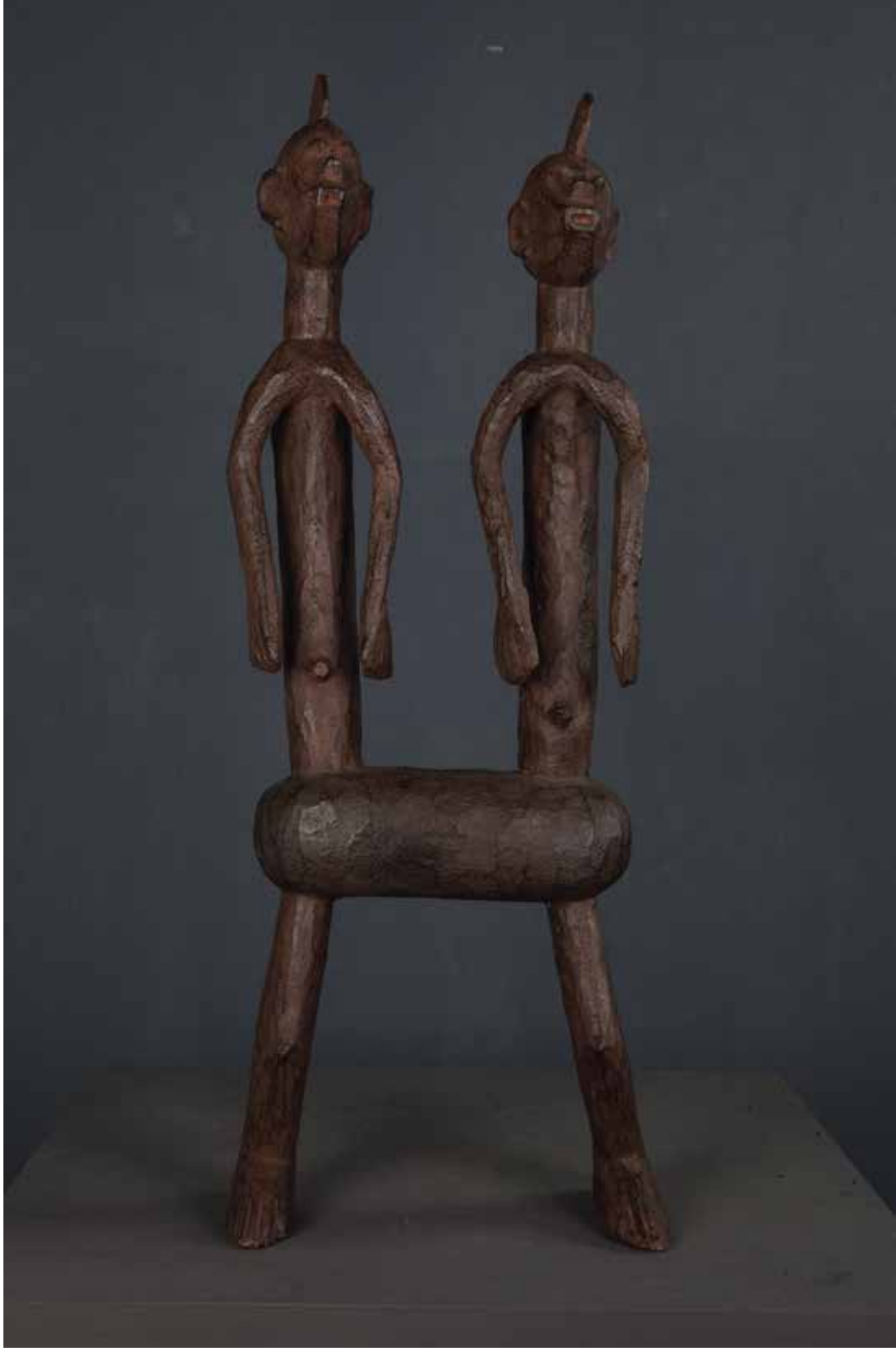
Male double figure. Chamba, Nigeria. First half 20th century. Wood. 26,4 x 9,8 x 5 Inches