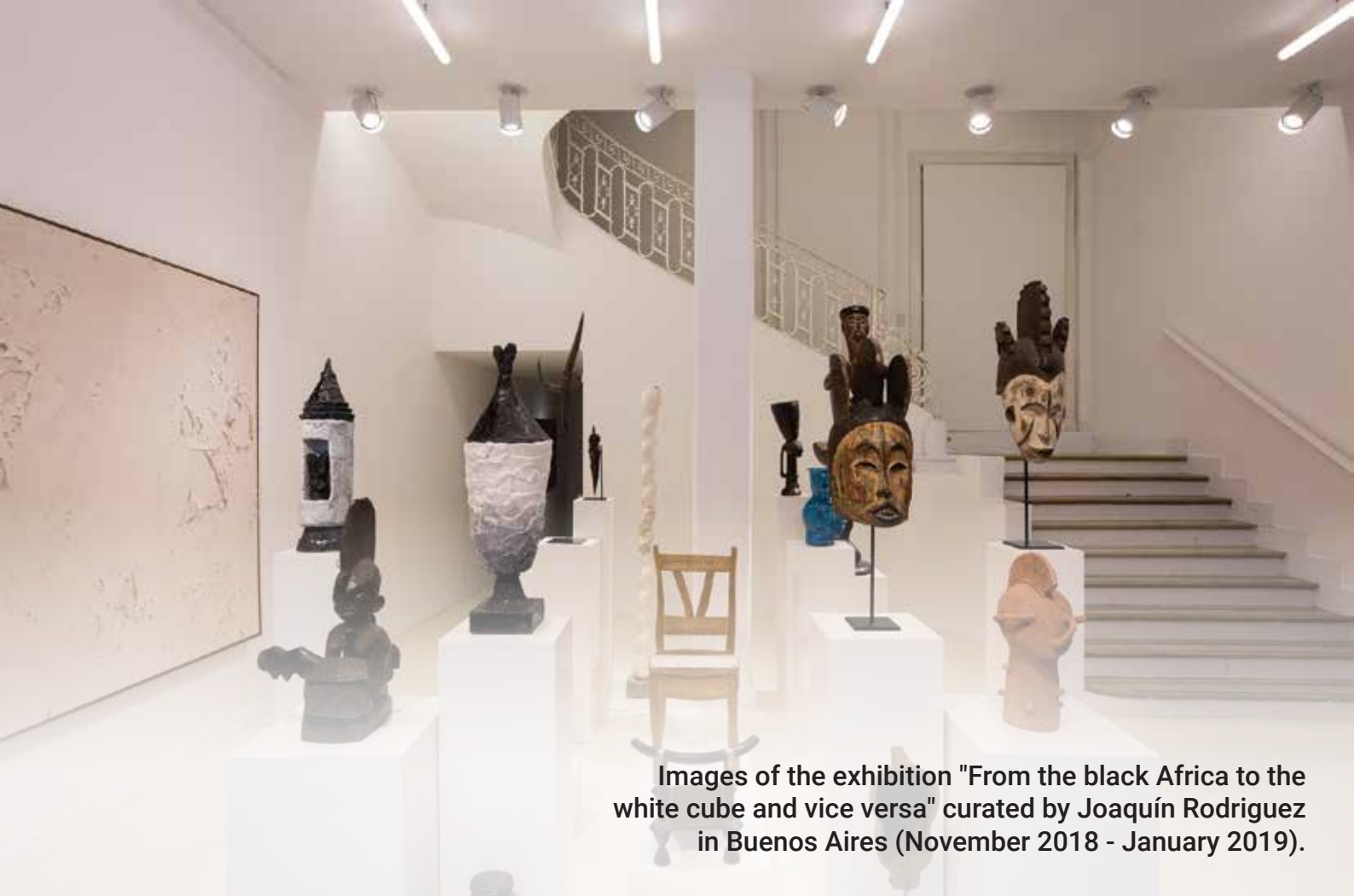
Images of the exhibition "From the black Africa to the white cube and vice versa" curated by Joaquín Rodríguez in Buenos Aires (November 2018 - January 2019).